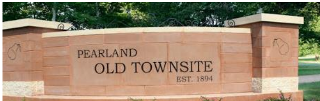
PEARLAND OLD TOWNSITE