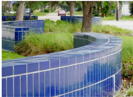
LAKE JACKSON DOWNTOWN